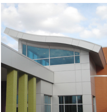
Oasis Inn Hotel Springfield, MO